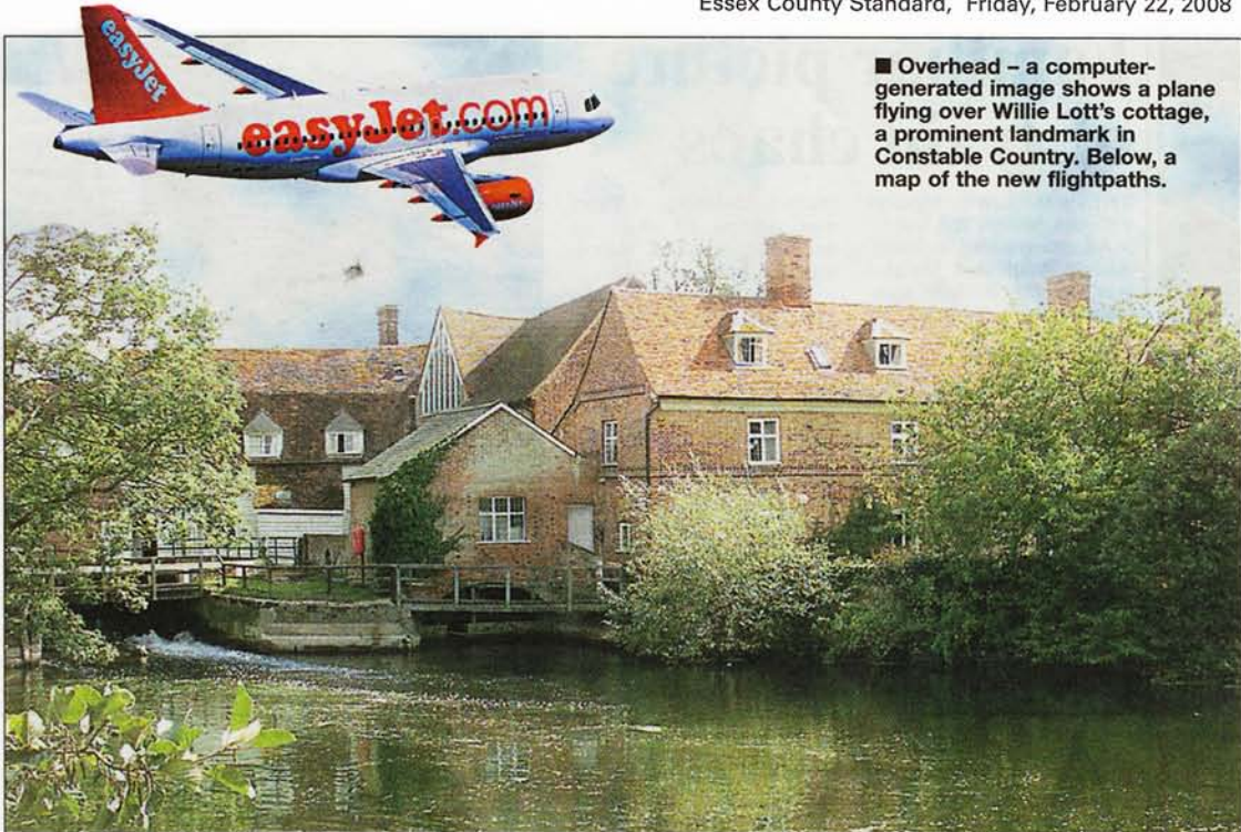
■ Overhead – a computer-generated image shows a plane flying over Willie Lott's cottage, a prominent landmark in Constable Country. Below, a map of the new flightpaths.