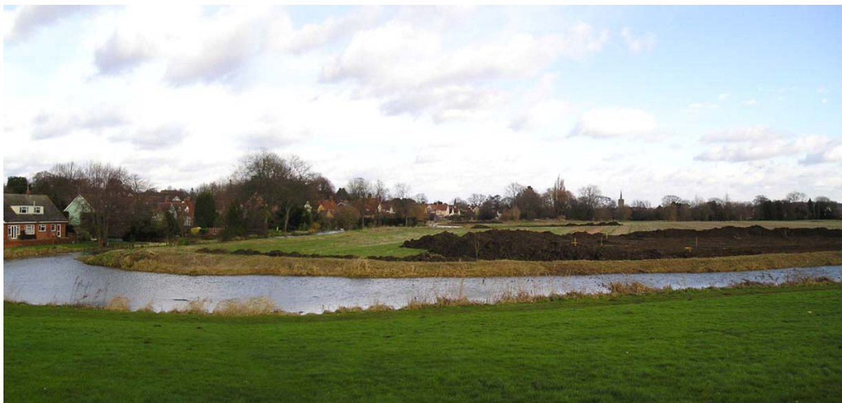
Work commenced in early February 2004