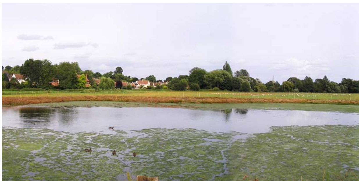
By Autumn 2005 sheep were grazing in the meadow

The area between the fence and the public footpath along the riverbank was hand sown with a wildflower and grass mixture in late April 2005, to create yet another habitat. This was slow to germinate initially but after an autumn cut last year this species rich strip is now growing well, adding to the environmental diversity of the land and to the enjoyment of walkers along the public footpath. Inevitably there are thistles, hemlock and burdock which need regular cutting back and pulling. Labour for this job is not easily found and so we rely on volunteers to lend a hand.