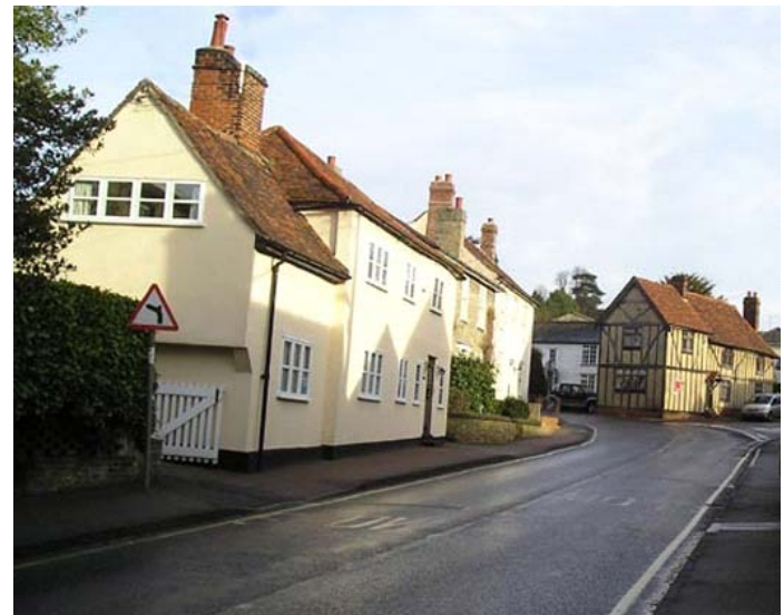
Sudbury Road, Bures

The centre of the village has many old historic buildings, some dating from the 16th and 17th century. Currently Bures has registered 75 listed buildings.