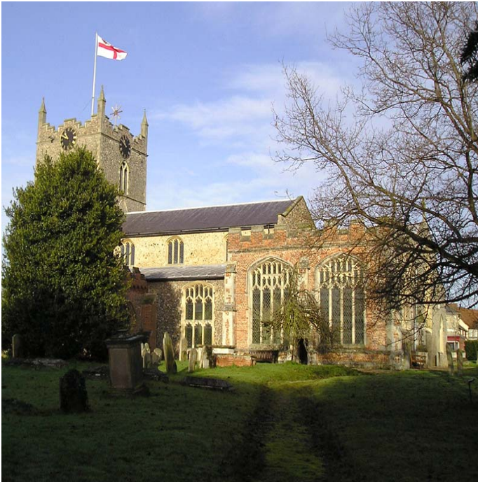
St Mary's Church, Bures

One of the oldest buildings is St Stephens Chapel found on the edge of the village which dates back to 1218 when it was dedicated by the Archbishop of Canterbury. It predates St Mary's Church in the village centre, by some 150 years. In 1659 the village was also known as "Bewers" before it gained its modern title of Bures.