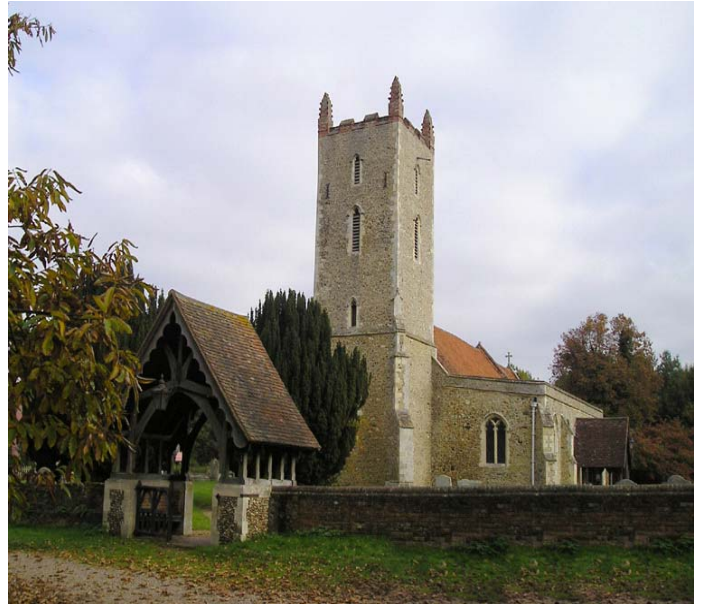
St. Mary's Church

Crop markings in the fields running along the valley floor show a Bronze Age settlement, probably 1800 BC, an iron age farm, between 1000 BC and 100 AD, and Roman cross roads, leading down to the ford at Boxted Mill.