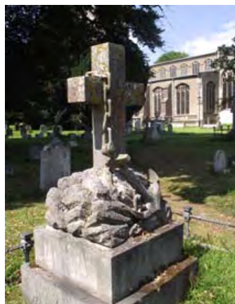
Naval Memorial – Dedham