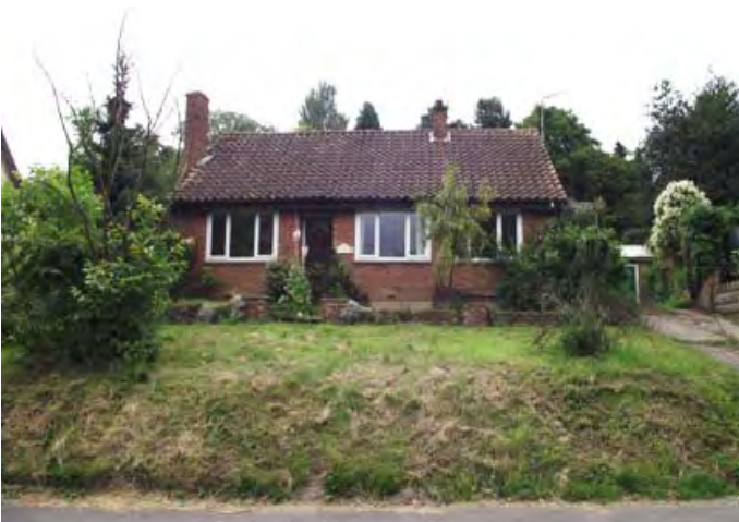
Knutmill, Scotland Street – Ripe for replacement