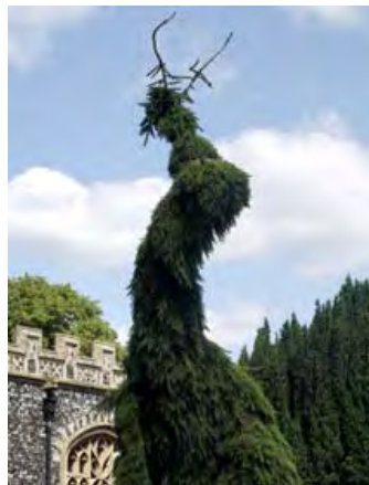
Monster Topiary – Stratford St Mary