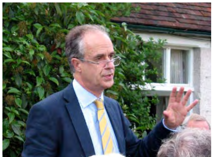
The Chairman addresses the Society's Summer Party at East Bergholt Place