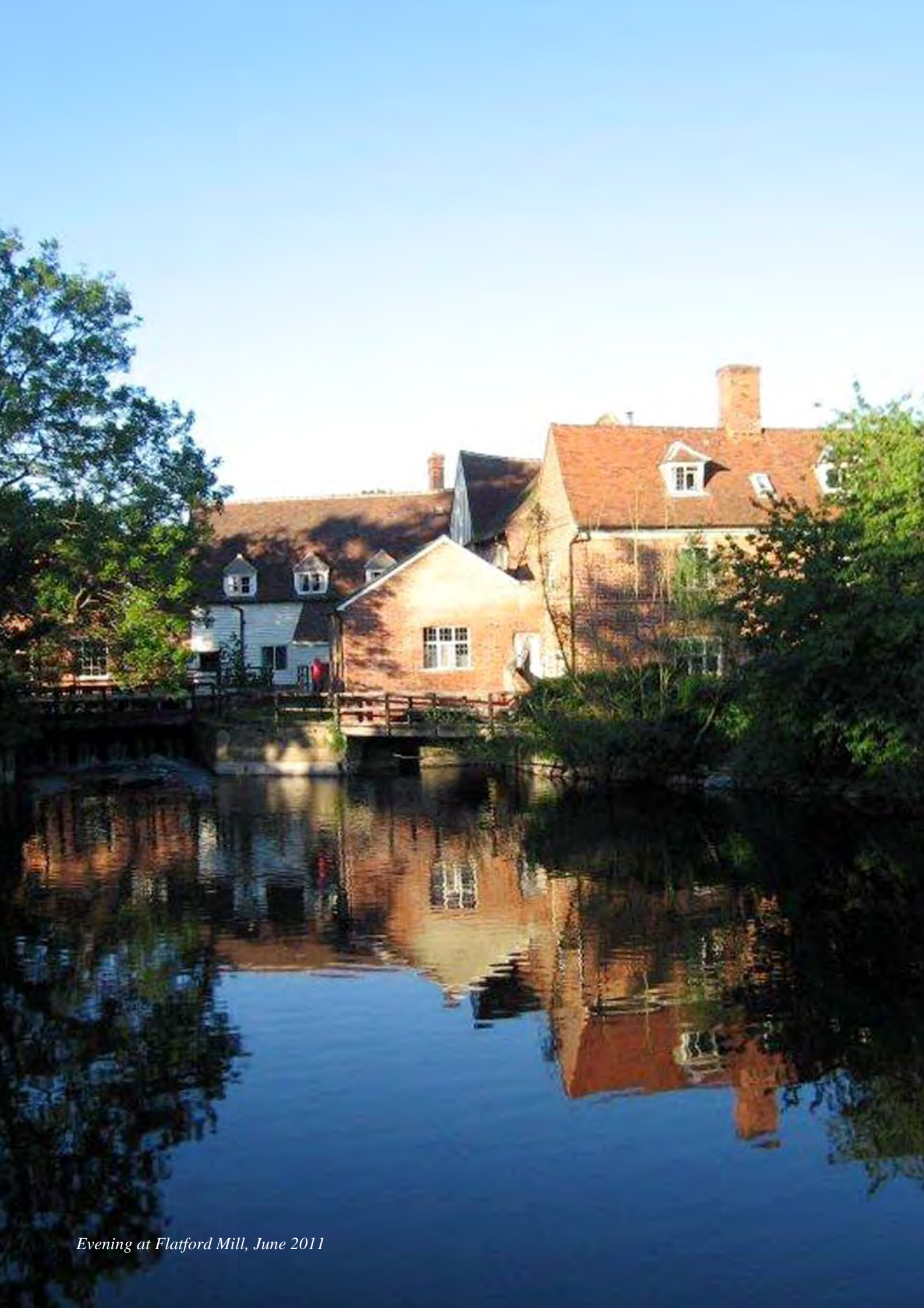
Evening at Flatford Mill, June 2011