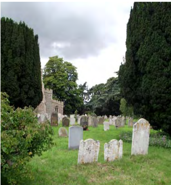
“Beneath those rugged elms, that yew-tree’s shade” – Stoke by Nayland