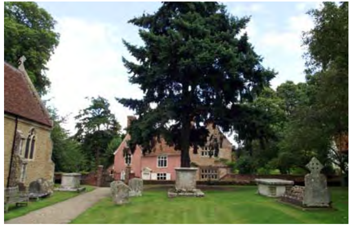
“Can storied urn or animated bust back to its mansion call the fleeting breath” – Wormingford