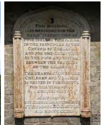
“But Knowledge to their eyes her ample page did ne’er unroll” - Langham