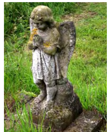
“Here rests his head upon the lap of earth, a youth to Fortune and to Fame unknown” - Great Horkesley