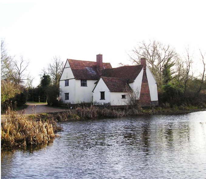
Willy Lott's Cottage – the scene of the Haywain is remarkably unchanged

www.nationaltrust.org.uk/main/w-vh/w-visits/w-findaplace/w-flatfordbridgecottage.htm