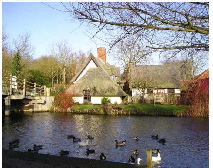
Bridge Cottage, Flatford