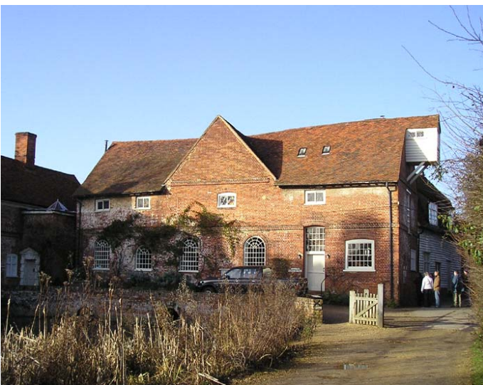
Flatford Mill, leased to the Field Studies Council which runs a wide range of courses in arts and environmental subjects.

The National Trust, which has substantial landholdings in the surrounding countryside, also owns the 16th-century Bridge Cottage, where it has an information centre, shop and café. From Flatford footpaths lead to Dedham, East Bergholt and Manningtree Station. Rowing boats can be hired in season.