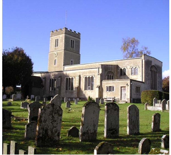
St. Peter and St Paul Church

The village has a wealth of listed Tudor houses primarily in Water Lane but an interesting property is a French Chateau, beautiful in all its details, which was constructed in the 1950s.